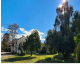
NominatedPhoto5873 452-olive 1