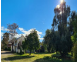
NominatedPhoto5873 452-olive 1