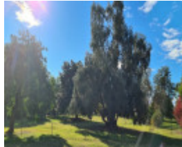
NominatedPhoto5874 813-olive 2