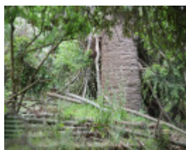
T12421 Bunya Bunya3