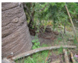
T12421 Bunya Bunya2