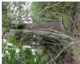
T12421 Bunya Bunya1