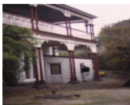
H1206 glenfine homestead