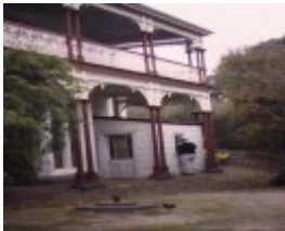
H1206 glenfine homestead