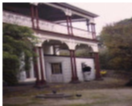
H1206 glenfine homestead