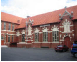
St Ignatius Church Richmond 3 May 2007 School Hall