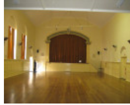
St Ignatius Church Richmond Sept 2007 School Hall Interior