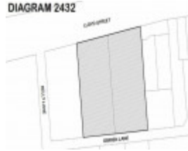
EXTENT DIAGRAM 2432