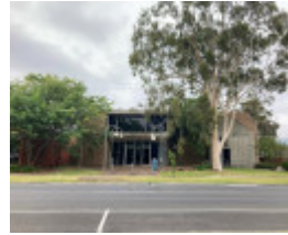
Moe Court Front of Building Feb 2022