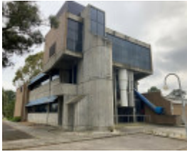
Moe Court Rear of Building Feb 2022