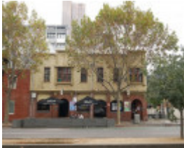
2022 east elevation