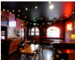
2022 ground floor dining room