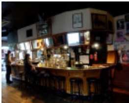
2022 ground floor bar