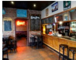
2022 ground floor bar looking to dining room