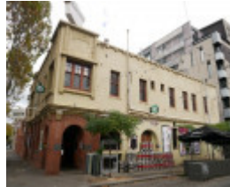
2022 north elevation