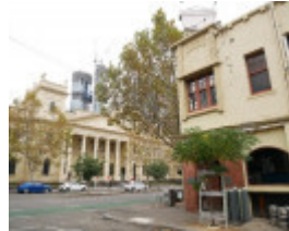
2022 view to trades hall