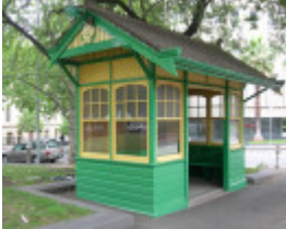
TRAM SHELTER SOHE 2008