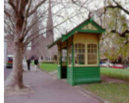
1 tram shelter cnr macarthur st & st andrews pl east melbourne