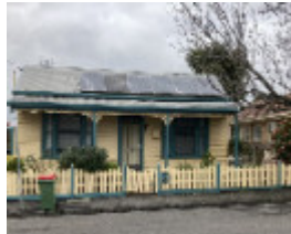
front early 2022 real estate photo