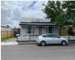
front late 2022