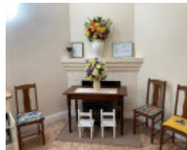
2022, Warracknabeal Ladies Rest Rooms, fireplace in kitchen