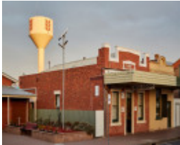
2021, Warracknabeal Ladies Rest Rooms northern elevation