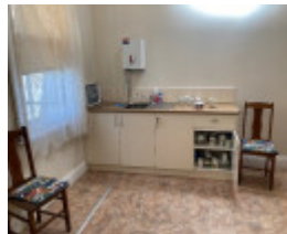
2022, Warracknabeal Ladies Rest Rooms, kitchen sink area