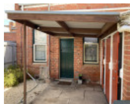
2022, Warracknabeal Ladies Rest Rooms, back door & covered area