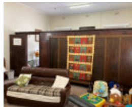
2022, Warracknabeal Ladies Rest Rooms, view of main lounge area and moveable screen