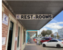
2022, Warracknabeal Ladies Rest Rooms, view south along Scott Street