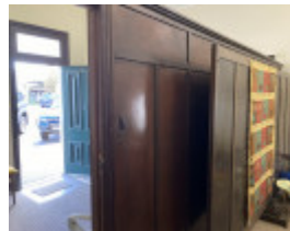
2022, Warracknabeal Ladies Rest Rooms, view out front door from main lounge room. Movable screen shown on RHS