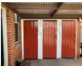
2022, Warracknabeal Ladies Rest Rooms