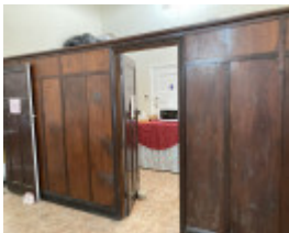
2022, Warracknabeal Ladies Rest Rooms, view into baby change area