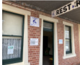
2022, Warracknabeal Ladies Rest Rooms, western elevation