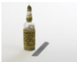
CSL collection 4 image Museums Victoria