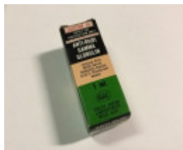
CSL collection 3 image Museums Victoria