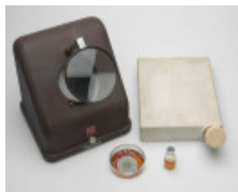
CSL collection 2 image Museums Victoria