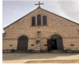
Southern elevation of church (front entrance)