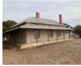
April 2023, Western elevation of the manse