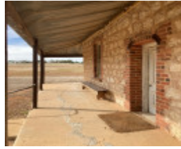
April 2023, North verandah looking east