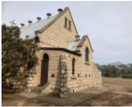
Northern elevation of church (rear entrance)