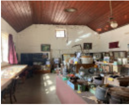
April 2023, School building interior view from north to south