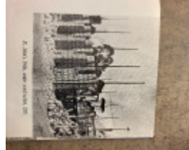
1910, St John's Pella under construction