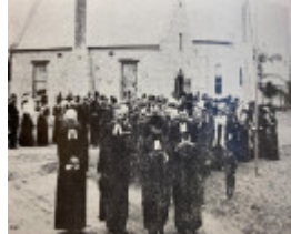
14 May 1911, Procession at the dedication of the Pella Church