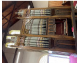
Organ located at the southern end of the church