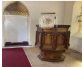
Pulpit with cloth