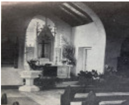
14 May 1911, Chancel at Pella Church, also showing the baptismal font and pews