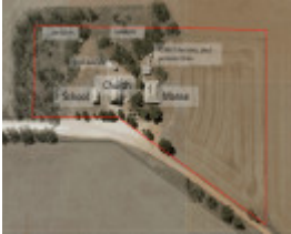
Aerial extent labelled