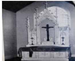
c.1917, Chancel at Pella Church