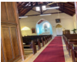
April 2023, Interior view from the south to the north of the church