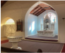
Altar with baptismal font in the foreground