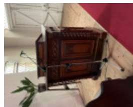
March 2023, Lectern