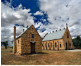
Pella St John's School building and church