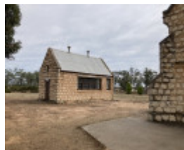
April 2023, Eastern elevation of school building