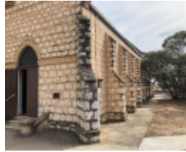
Southeast elevation of church