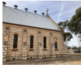
Western elevation of the church