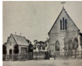
c.1917, Pella Church and School