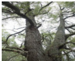
NominatedPhoto6135 68-2P8A6473 750x750