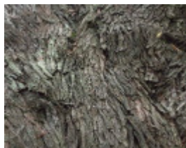
NominatedPhoto6133 928-2P8A6456 750x750