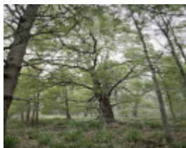
NominatedPhoto6137 141-2P8A6452 750x750