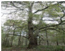
NominatedPhoto6134 678-2P8A6460 750x750