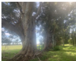
NominatedPhoto6367 427- Tree 1 750x750