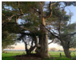
NominatedPhoto6369 932- Tree 3 750x750