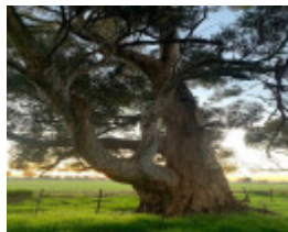
NominatedPhoto6368 358- Tree 2 750x750