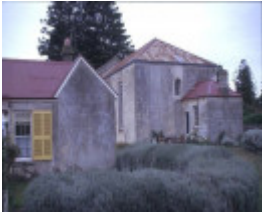
h00850 former st andrews presbyterian church and manse william st port fairy rear of manse and church she project 2003