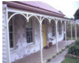
h00850 former st andrews presbyterian church and manse william st port fairy manse front verandah she project 2003