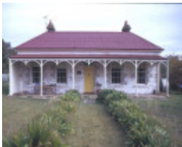
h00850 former st andrews presbyterian church and manse william st port fairy front of manse she project 2003