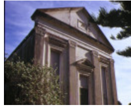
Former St Andrews Presbyterian Church & Manse William Street Port Fairy Front Elevation of Church June 1989