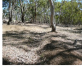
HARD HILL MINING SITE SOHE 2008