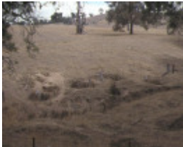
1 hard hill mining site garden gully road stawell landscape mar1990