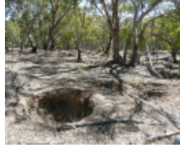
HARD HILL MINING SITE SOHE 2008