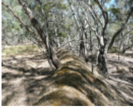
HARD HILL MINING SITE SOHE 2008