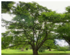
NominatedPhoto6702 926- Werribee Park trees - 6 750x750