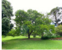
NominatedPhoto6702 493- Werribee Park trees - 3 750x750