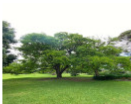
NominatedPhoto6702 530- Werribee Park trees - 4 750x750