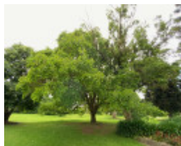
NominatedPhoto6701 577- Werribee Park trees - 2 750x750