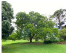
NominatedPhoto6702 493- Werribee Park trees - 3 750x750