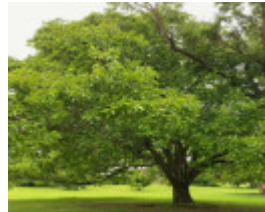
NominatedPhoto6700 185- Werribee Park trees - 1 750x750