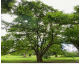
NominatedPhoto6702 926- Werribee Park trees - 6 750x750