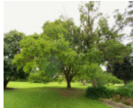
NominatedPhoto6701 577- Werribee Park trees - 2 750x750