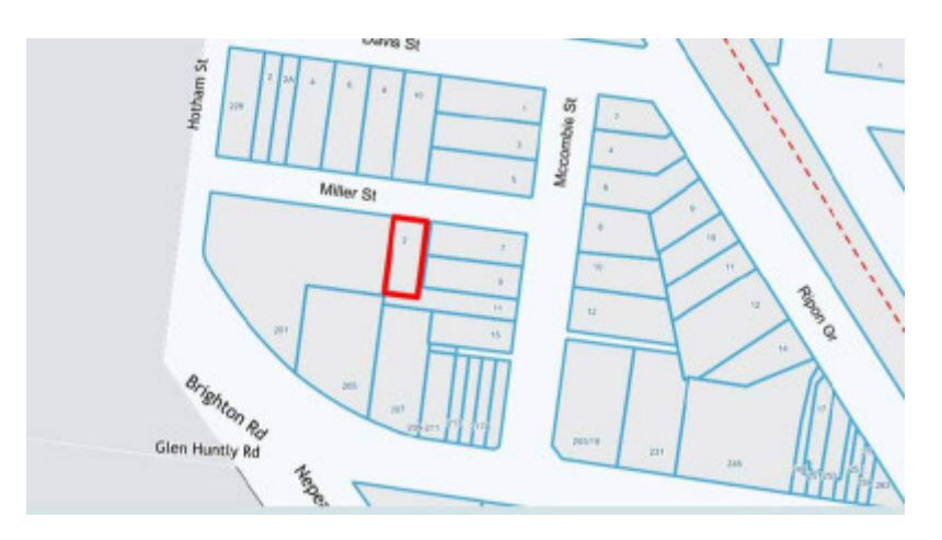
10th Caulfield Scout Hall August 2019-2-map