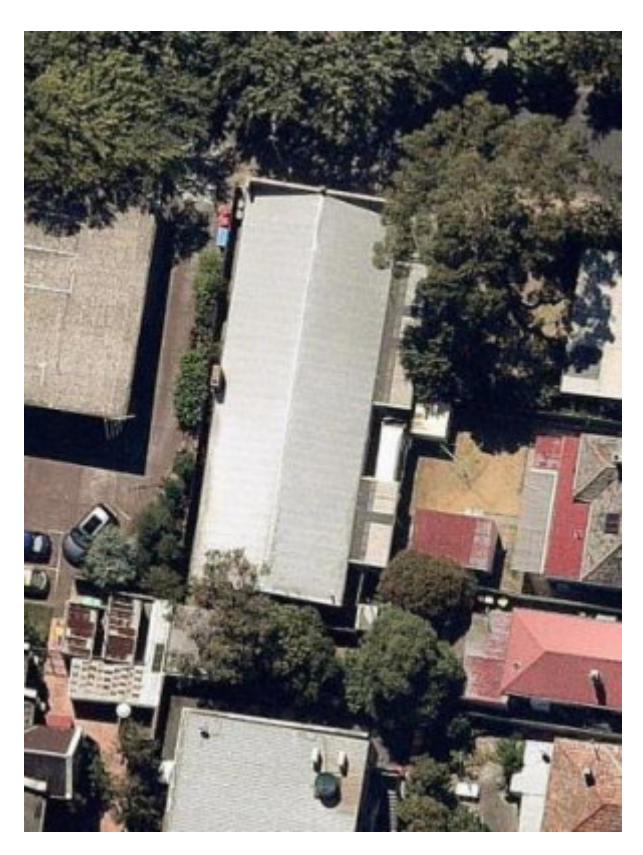
10th Caulfield Scout Hall August 2019-12