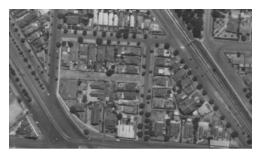
10th Caulfield Scout Hall August 2019-10