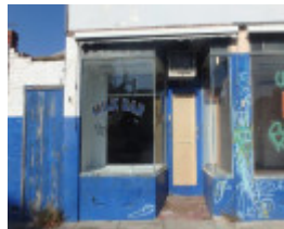
12 Hartington Street Elsternwick August 2019-7