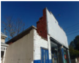
12 Hartington Street Elsternwick August 2019-5