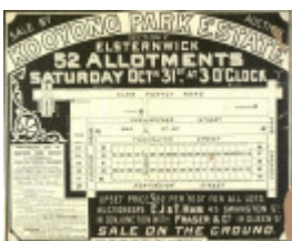
12 Hartington Street Elsternwick August 2019-12