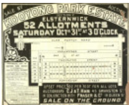
12 Hartington Street Elsternwick August 2019-12