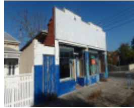
12 Hartington Street Elsternwick August 2019-3