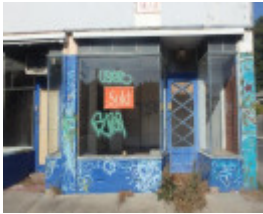
12 Hartington Street Elsternwick August 2019-8