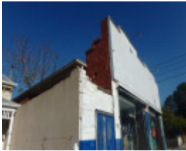
12 Hartington Street Elsternwick August 2019-5