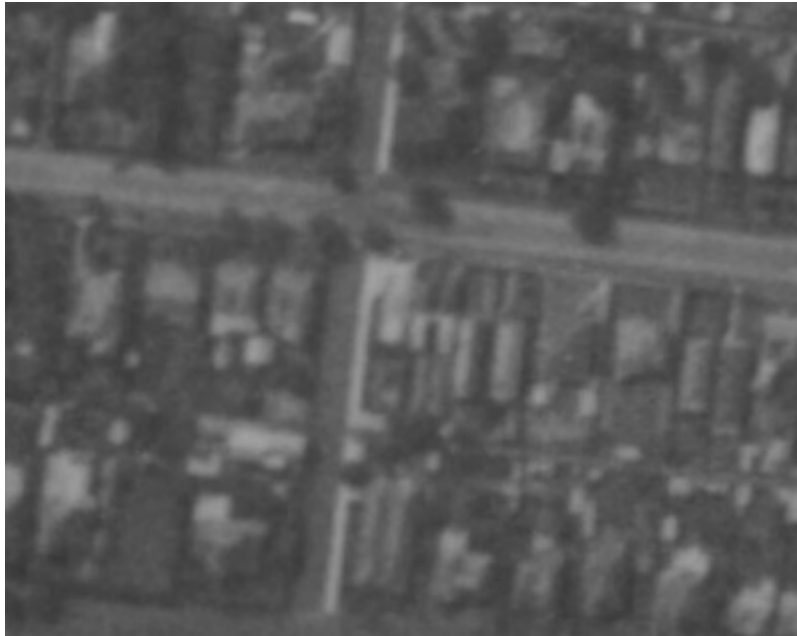
12 Hartington Street Elsternwick August 2019-14