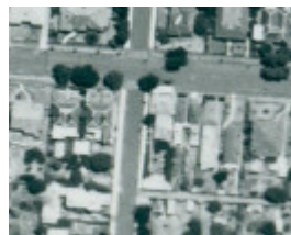
12 Hartington Street Elsternwick August 2019-15