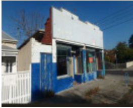
12 Hartington Street Elsternwick August 2019-1