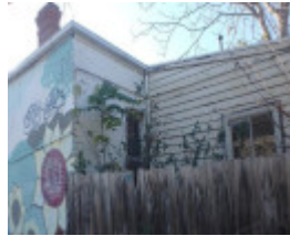
12 Hartington Street Elsternwick August 2019-10