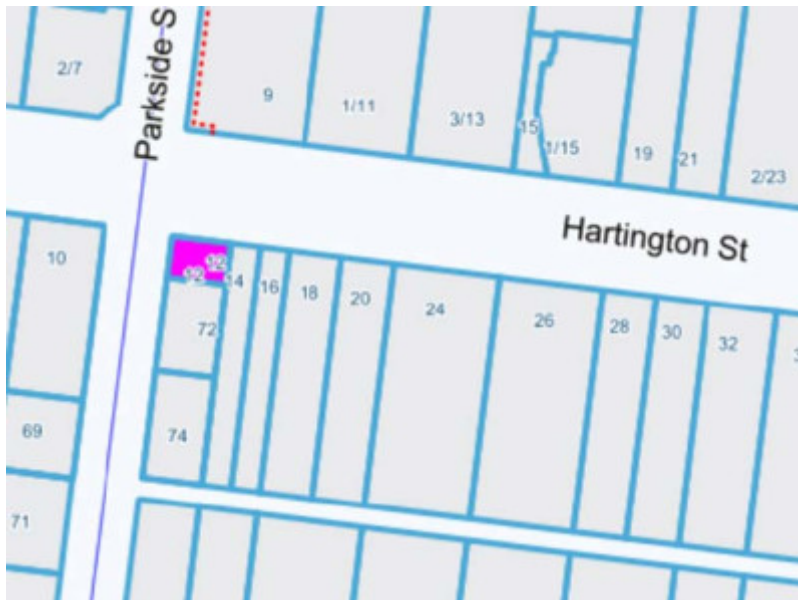
12 Hartington Street Elsternwick August 2019-2-map