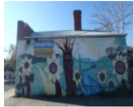
12 Hartington Street Elsternwick August 2019-9