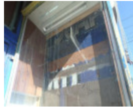
12 Hartington Street Elsternwick August 2019-6