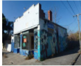
12 Hartington Street Elsternwick August 2019-4