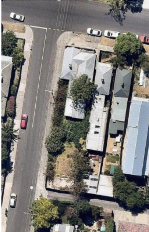
12 Hartington Street Elsternwick August 2019-16