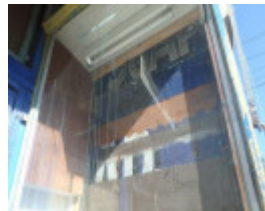
12 Hartington Street Elsternwick August 2019-6