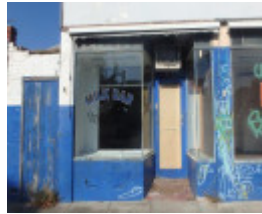
12 Hartington Street Elsternwick August 2019-7