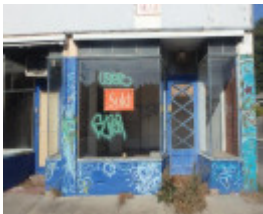
12 Hartington Street Elsternwick August 2019-8