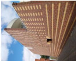
2024 - east elevation