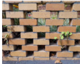
2024 - detail - hit and miss cream brick fence