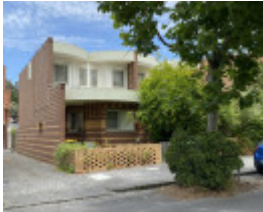
2024 Kay Street Infill Housing