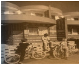
c1983 - the houses featured in New Houses for Old