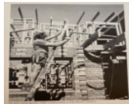
1982 - Kay Street Housing under construction - Housing Commission Annual Report