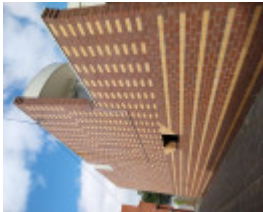
2024 - east elevation