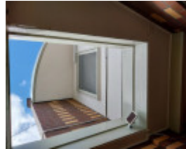
2024 - entry way