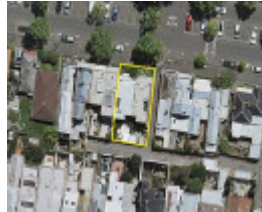
2024 Aerial diagram - extent of registration