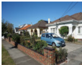
Albert Flatmans Estates Precinct