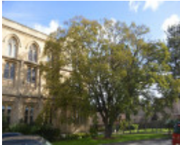
04 CP Parkville