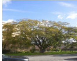
03 CP Parkville