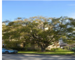
07 CP Parkville