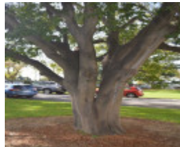
05 CP Parkville