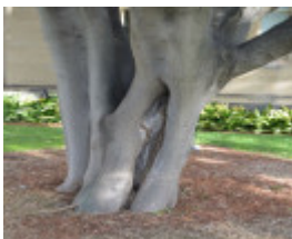
06 CP Parkville