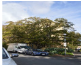
01 CP Parkville