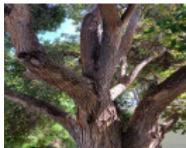
thumbnail IMG 4268