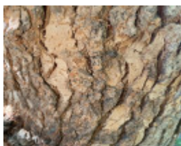
thumbnail IMG 4271