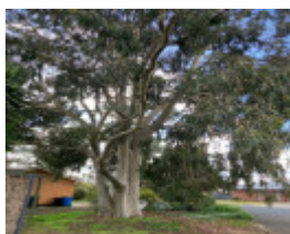
thumbnail euc cit 3