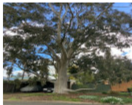
thumbnail Euc citriona 2