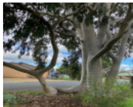
thumbnail euc cit 5