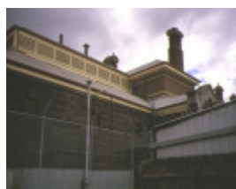
police station drummond street carlton lock up & watchhouse 1997