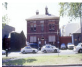
h01543 police station drummond street carlton front