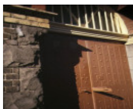
police station drummond street carlton detail of lockup door