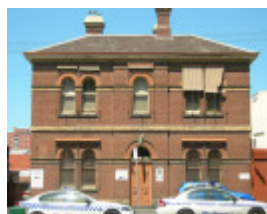
POLICE STATION SOHE 2008