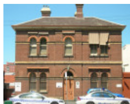
POLICE STATION SOHE 2008