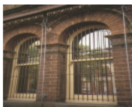
police station drummond street carlton detail of windows