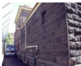
h01543 police station drummond street carlton side building b