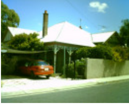
113 Weller Street, Geelong West