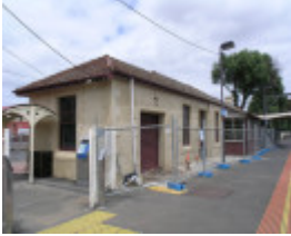
WERRIBEE RAILWAY STATION SOHE 2008