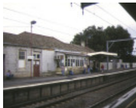
1 werribee railway station comben street werribee rear elevation oct1996