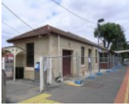
WERRIBEE RAILWAY STATION SOHE 2008