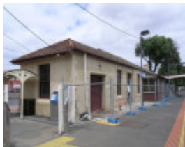
WERRIBEE RAILWAY STATION SOHE 2008