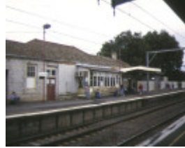
1 werribee railway station comben street werribee rear elevation oct1996