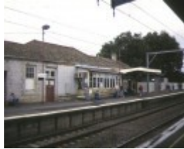
1 werribee railway station comben street werribee rear elevation oct1996