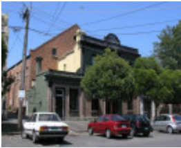
FORMER LAUDERS RIDING SCHOOL (EMERALD HALL) SOHE 2008