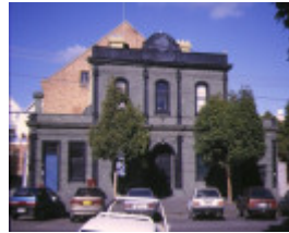
1 former lauders riding school south melbourne front view jun1998