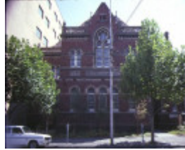
1 former primary school number 2365 queensberry street carlton front view feb1985