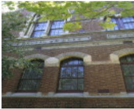
former primary school number 2365 queensberry street carlton detail of front windows