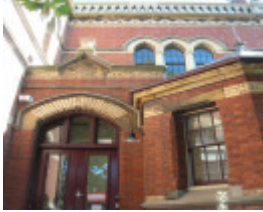
FORMER PRIMARY SCHOOL NO. 2365 SOHE 2008