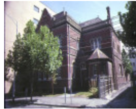
former primary school number 2365 queensberry street carlton front corner view feb1985