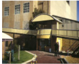
former primary school number 2365 queensberry street carlton new development