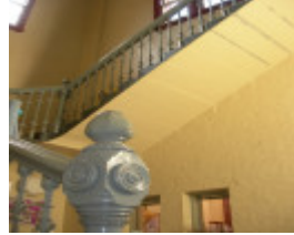
FORMER PRIMARY SCHOOL NO. 2365 SOHE 2008