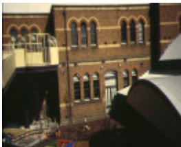
former primary school number 2365 queensberry street carlton rear view newly developed courtyard