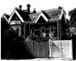
City of Kew Urban Conservation Study 1988