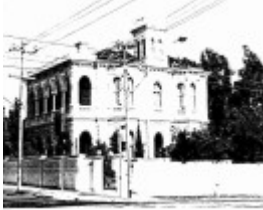
City of Kew Urban Conservation Study 1988