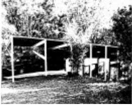
City of Kew Urban Conservation Study 1988