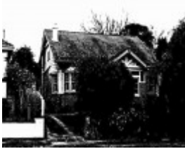
City of Kew Urban Conservation Study 1988