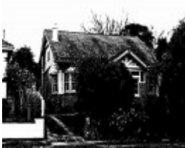
City of Kew Urban Conservation Study 1988