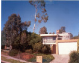
22365 House - 18 Summit Drive, Bulleen