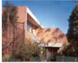
22365 House - 18 Summit Drive, Bulleen (B)