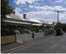
Dover Road and John Street Precinct, Hobsons Bay Heritage Study 2006