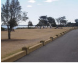
Esplanade Foreshore Heritage Precinct, Hobsons Bay Heritage Study 2006