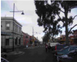
Ferguson St & Douglas Pde Com. Prec., Hobsons Bay Heritage Study 2006