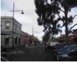
Ferguson St & Douglas Pde Com. Prec., Hobsons Bay Heritage Study 2006