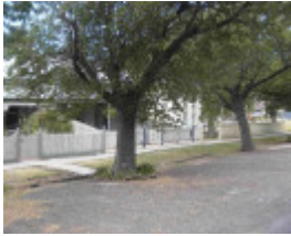
Hanmer Street Heritage Precinct, Hobsons Bay Heritage Study 2006