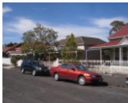
James Street Heritage Precinct WILLIAMSTOWN, Hobsons Bay Heritage Study 2006