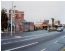
Melbourne Road Commercial Precinct NEWPORT, Hobsons Bay Heritage Study 2006