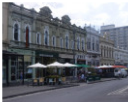
HNelson Place Heritage Precinct WILLIAMSTOWN, Hobsons Bay Heritage Study 2006