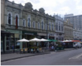
HNelson Place Heritage Precinct WILLIAMSTOWN, Hobsons Bay Heritage Study 2006