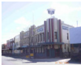
Newport Civic and Commercial Precinct, Hobsons Bay Heritage Study 2006