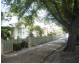
Pasco Street Heritage Precinct WILLIAMSTOWN, Hobsons Bay Heritage Study 2006