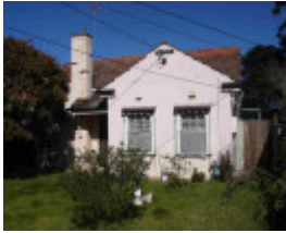
Solomit or Straw House Heritage Precinct ALTONA, Hobsons Bay Heritage Study 2006 - 169 Maidstone Street