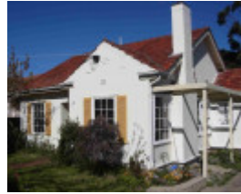
Solomit or Straw House Heritage Precinct ALTONA, Hobsons Bay Heritage Study 2006 - 171 Maidstone Street