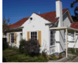
Solomit or Straw House Heritage Precinct ALTONA, Hobsons Bay Heritage Study 2006 - 171 Maidstone Street