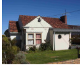
Solomit or Straw House Heritage Precinct ALTONA, Hobsons Bay Heritage Study 2006 - 173 Maidstone Street