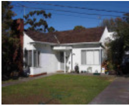
Solomit or Straw House Heritage Precinct ALTONA, Hobsons Bay Heritage Study 2006 - 175 Maidstone Street