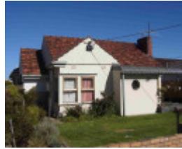
Solomit or Straw House Heritage Precinct ALTONA, Hobsons Bay Heritage Study 2006 - 173 Maidstone Street