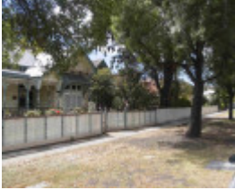
Victoria Street Heritage Precinct WILLIAMSTOWN, Hobsons Bay Heritage Study 2006