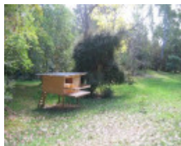
22565 Paringa - 7 Atkinson Street, Templestowe (6)