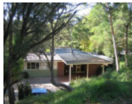
22565 Paringa - 7 Atkinson Street, Templestowe (1)