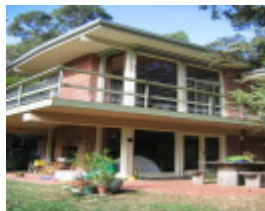
22565 Paringa - 7 Atkinson Street, Templestowe (2)