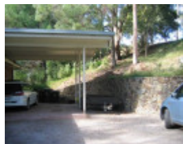
22565 Paringa (carport) - 7 Atkinson Street, Templestowe (4)