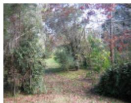
22565 Paringa - 7 Atkinson Street, Templestowe (7)