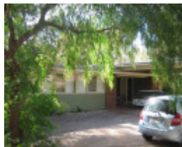
22565 Paringa - 7 Atkinson Street, Templestowe (3)