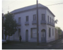
1 former queen anne hotel dorcass street south melbourne front view aug1998