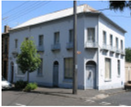
FORMER QUEENS ARMS HOTEL SOHE 2008