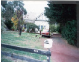
22609 House - 205 Serpells Road (cnr Smiths), Templestowe