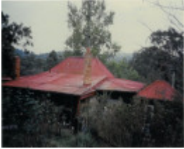
22625 Nilja - Alexander Road, Warrandyte