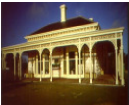
h01899 the anchorage sorrento nepean hwy