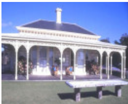
h01899 the anchorage nepean hwy sorrento front exterior she project 2003