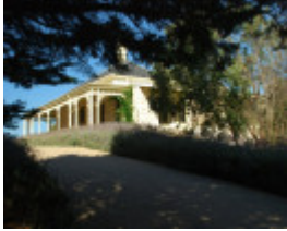
THE ANCHORAGE SOHE 2008