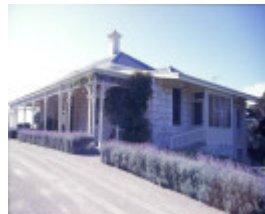
h01899 the anchorage nepean hwy sorrento side view she project 2003