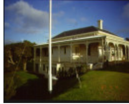
The Anchorage Sorrento