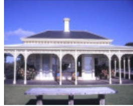
h01899 1 the anchorage nepean hwy sorrento close up front she project 2003