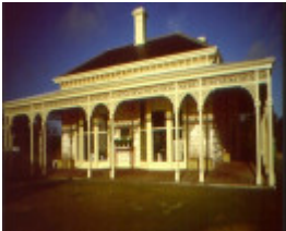
h01899 the anchorage sorrento nepean hwy