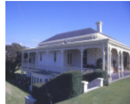
h01899 the anchorage nepean hwy sorrento west view she project 2003