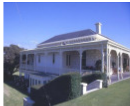
h01899 the anchorage nepean hwy sorrento west view she project 2003