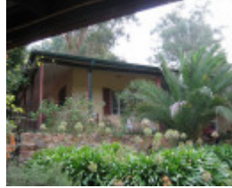
22705 House - 318 Yarra Street, Warrandyte