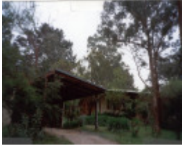
22705 House - 318 Yarra Street (165 Brackenbury St), Warrandyte