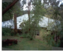
22705 House - 318 Yarra Street, Warrandyte